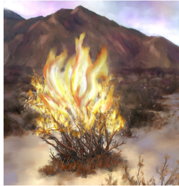
“Rekindle the gift of God within you...” 2 Timothy 1:6

“Stewardship” is the work we do as Christians to further God’s kingdom in the world. It’s our effort to help others, in ways big and small.